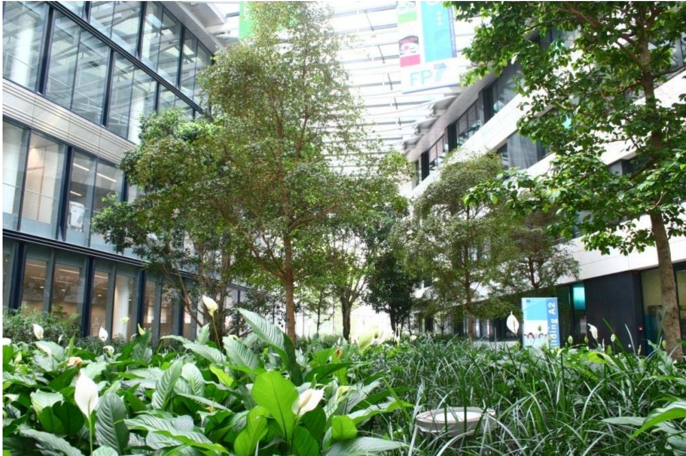
Architects: ART & BUILD / MONTOIS PARTNERS